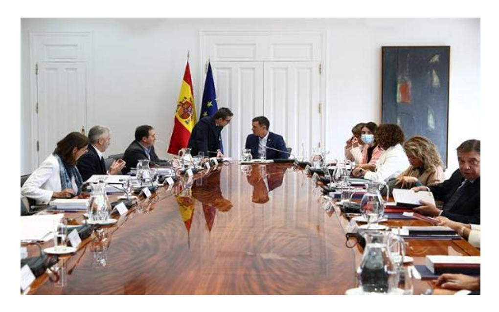
Meeting of the National Security Council 11/10/2022

Since its first meeting on February 2, the Situation Committee (the highest level of coordination chaired by the Ministry of the Presidency) has met up to 18 times. During its last meeting, held on October 10, the Committee set up a new Working Group to coordinate all matters related to the energy crisis caused by Russia's invasion of Ukraine.