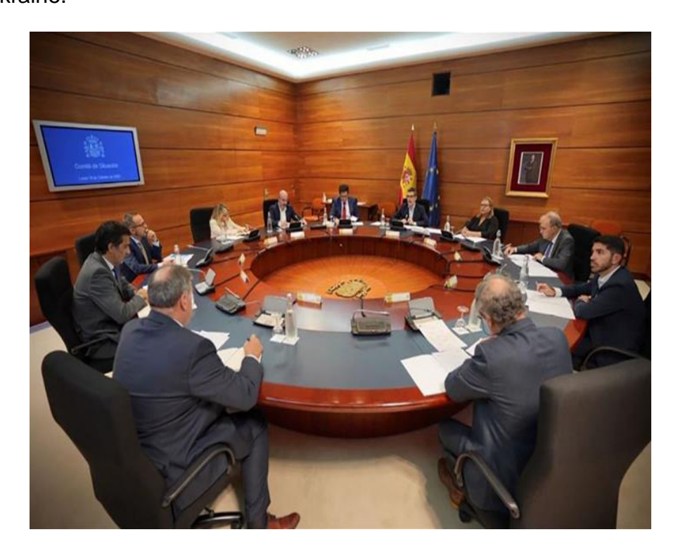
Situation Committee Meeting on 10/10/2022

Ever since their establishment, these working groups include the participation of duly designated departments and agencies. They are organized to ensure an active coordination, monitoring and management of the crisis, as well as to verify and increase the effectiveness of the measures approved.