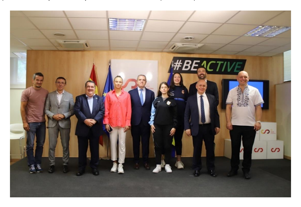
Signing of the Protocol at the CSD. Madrid, June 22, 2022

On June 22, at the headquarters of the Superior Sports Council, a Protocol to facilitate federated sports practice for Ukrainian children and adolescents was officially presented. This protocol aims to facilitate federated sports to displaced minors and adolescents from Ukraine forced to interrupt their practice, with a double inclusion itinerary depending on whether they are high-level athletes or not. The event gathered all organizations involved in the development of the protocol: the High Commissioner for the Fight against Child Poverty (ACPI), the Superior Sports Council (CSD) of the Ministry of Culture and Sports, the Spanish Federation of Municipalities and Provinces (FEMP) and the Spanish Sports Association (ADESP).