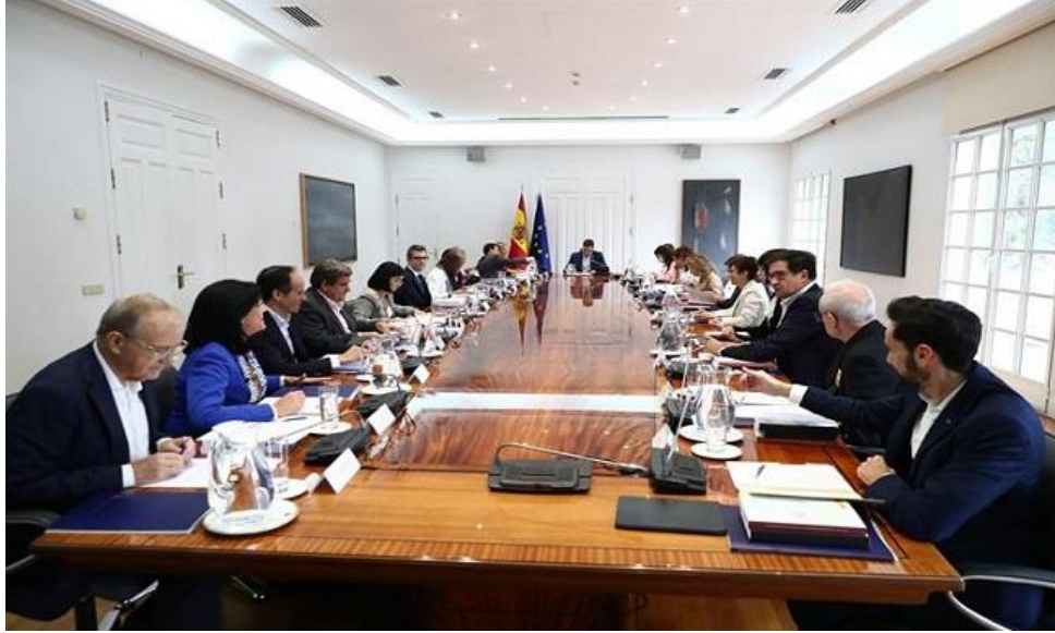
Meeting of the National Security Council 11 October 2022

Since its first meeting on February 2, the Situation Committee (the highest level of coordination chaired by the Ministry of the Presidency) has met up to 18 times. During its last meeting, held on October 10, the Committee set up a new Working Group to coordinate all matters related to the energy crisis caused by Russia's invasion of Ukraine.