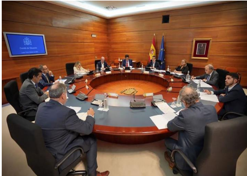
Meeting of the Situation Committee 10 October 2022

Ever since their establishment, these working groups include the participation of duly designated departments and agencies. They are organized to ensure an active coordination, monitoring and management of the crisis, as well as to verify and increase the effectiveness of the measures approved.