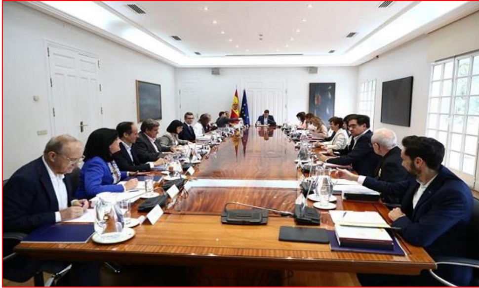
Meeting of the National Security Council 12 April 2023

For its part, the Situation Committee —the highest level of coordination, chaired by the acting Minister of the Presidency, Félix Bolaños— has met up to 24 times since its first meeting on February 2. During its last meeting, held on 3 October 2023, the Committee analyzed the status of the conflict between Russia and Ukraine, as well as its repercussions in different areas at the national and international level.