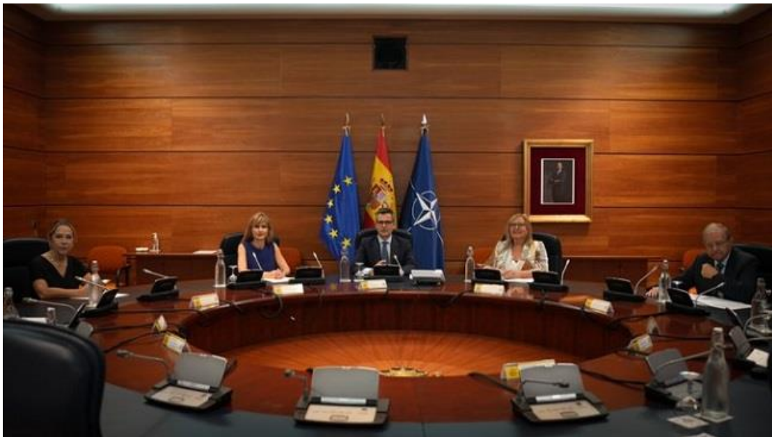
Meeting of the Situation Committee October 03 2023

Ever since their establishment, these working groups include the participation of duly designated ministerial departments and agencies. They are organized to ensure an active coordination, monitoring and management of the crisis, as well as to verify and increase the effectiveness of the measures approved.