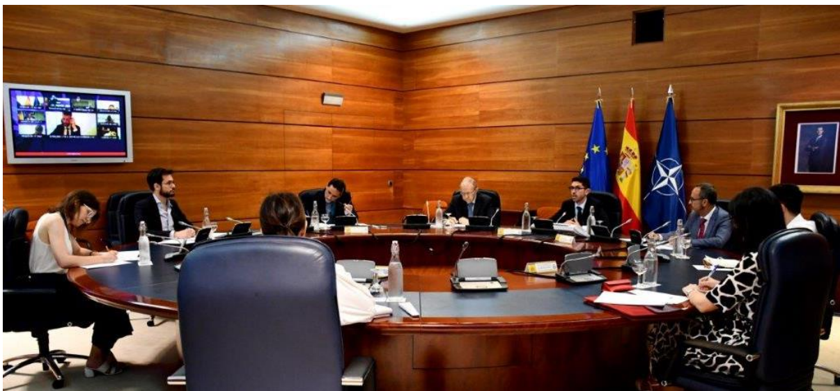
Reunión del Grupo de Trabajo de Recepción y Protección Temporal 27/06/2023.

The EU temporary protection mechanism, which was activated on March 4, 2022, was automatically extended for one year, until March 2024. On September 28, 2023, the Council of the European Union agreed to extend the temporary protection of people fleeing the conflict between Russia and Ukraine from March 4, 2024 to March 4, 2025. The acting Minister of the Interior of Spain has assured that «EU will support the Ukrainian people for as long as necessary»