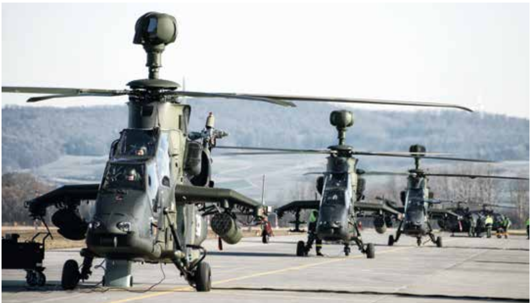
Modernising armaments procurement – a complex challenge.