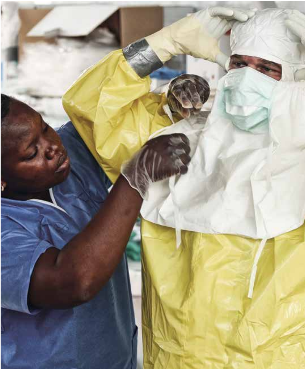
Epidemics and pandemics – believed to be far away, but closer than we think owing to globalisation.

Germany supports the prevention and management of such challenges in particular through improvements to the coordination and crisis management capabilities of multilateral organisations like WHO. Important contributions in this respect are, for example, support for existing European instruments under the EU Civil Protection Mechanism (European Medical Corps) and the creation of a contingent of physicians and specialist medical personnel at both national and European levels as well as logistical capabilities for rapidly deploying such personnel to crisis regions.