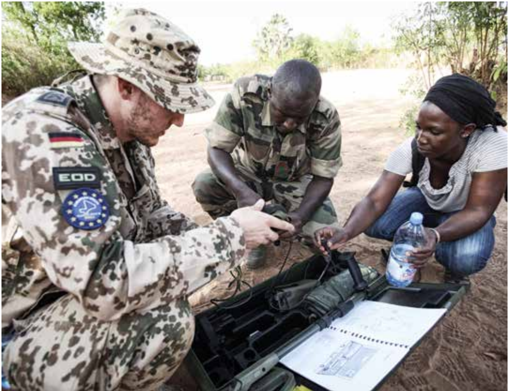
The EU on operations – cohesion and comprehensive action are the key.

With its 500 million citizens, the European Union must act coherently and effectively in a highly volatile security environment. In view of the wide range of challenges and limited national options, we must strengthen European attempts to make the necessary structures more efficient and to eliminate existing capability deficits.