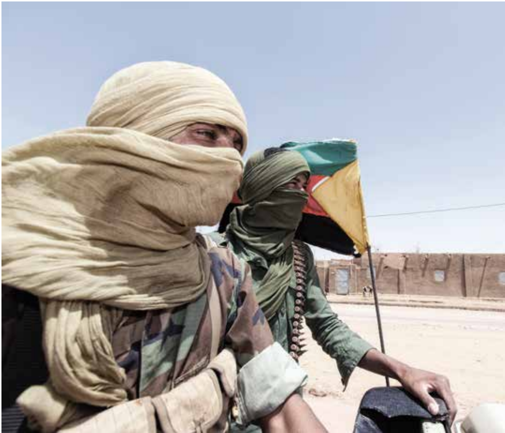
Fragile statehood – instability near and far directly affects Germany.

This instability in Europe’s neighbourhood fosters the creation of safe havens for international terrorist networks and human trafficking groups and can impair international trade and the global supply of energy and resources. It is thus a risk for our security.