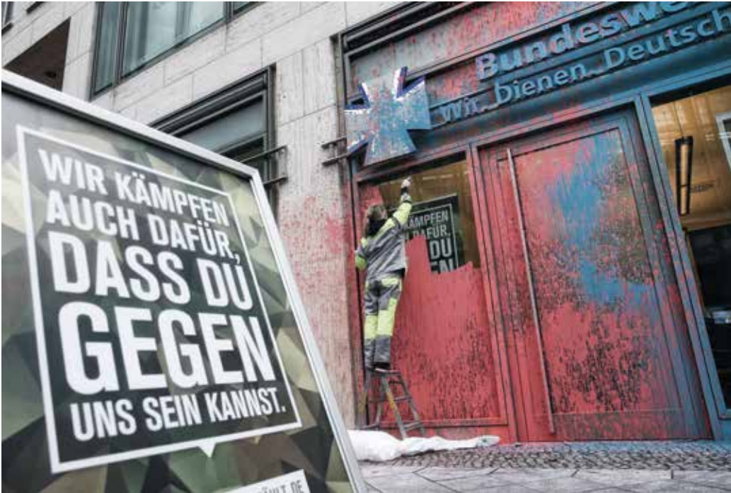
Controversy is colourful – the Bundeswehr is ready and willing to debate.

This relationship helps servicemen and women in particular to perform their mission. They feel supported by the people whose rights and freedom they have sworn to bravely protect and, in extreme circumstances, even lay down their lives for. In this spirit, the Bundeswehr promotes discourse on security policy in our country, for example through its youth officers. A constant exchange about the Bundeswehr and its tasks is needed and should be as extensive and serious as possible and as controversial as necessary.