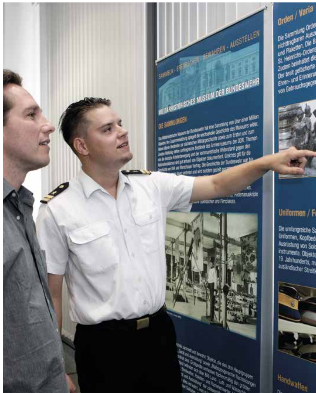
Cultivating traditions in the Bundeswehr – a culture of open dialogue and personal commitment make it possible.

Traditions are cultivated in the Bundeswehr by passing values, symbols and guiding examples down to the next generation, especially in our more recent history. This is based on a culture of open dialogue and personal commitment.