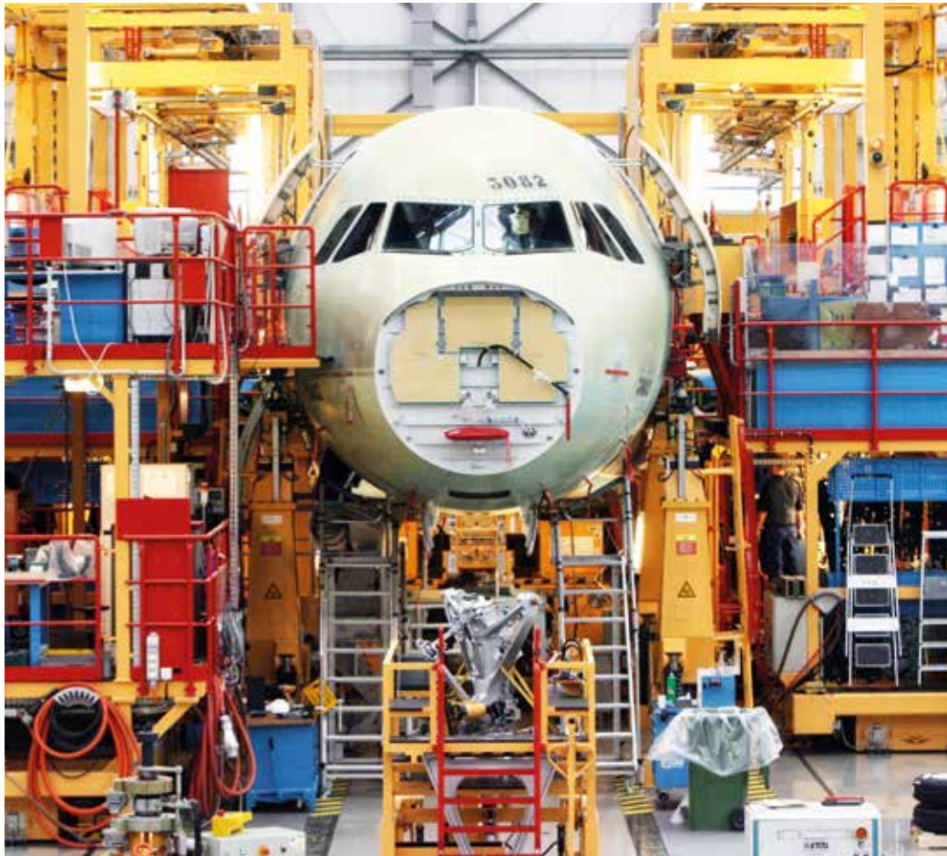
Business in Germany – an Airbus passenger aircraft being assembled in Hamburg, a centre of high technology.

At the same time, our ability to respond in an international – and particularly European and transatlantic – context is based on a clear national position.