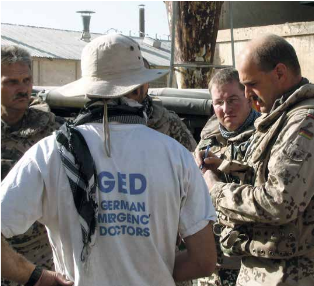
Cooperation between state and non-state actors – vital for successful mission accomplishment of the Bundeswehr.