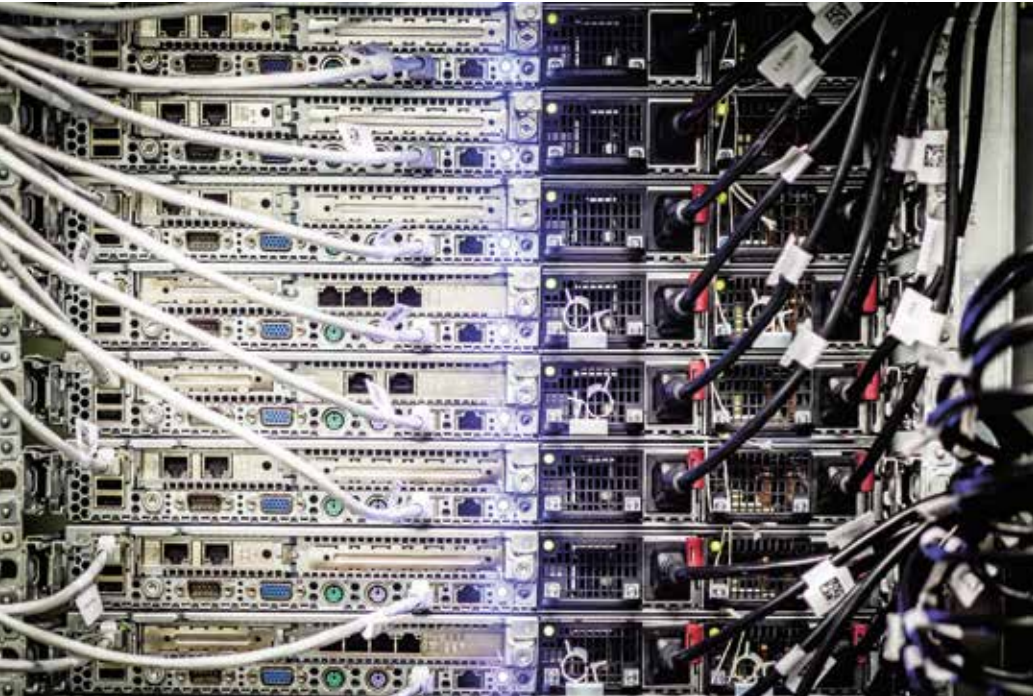
Worthwhile targets – our interconnectedness creates vulnerabilities.

Access to destructive malware is relatively easy and inexpensive. As a result, the means to carry out cyber attacks are not restricted to state actors. Terrorist groups, criminal organisations, and skilled individuals can potentially cause serious damage with minimal effort. Attempts to establish internationally binding regulations or confidence- and security-building measures may therefore have only a limited effect.