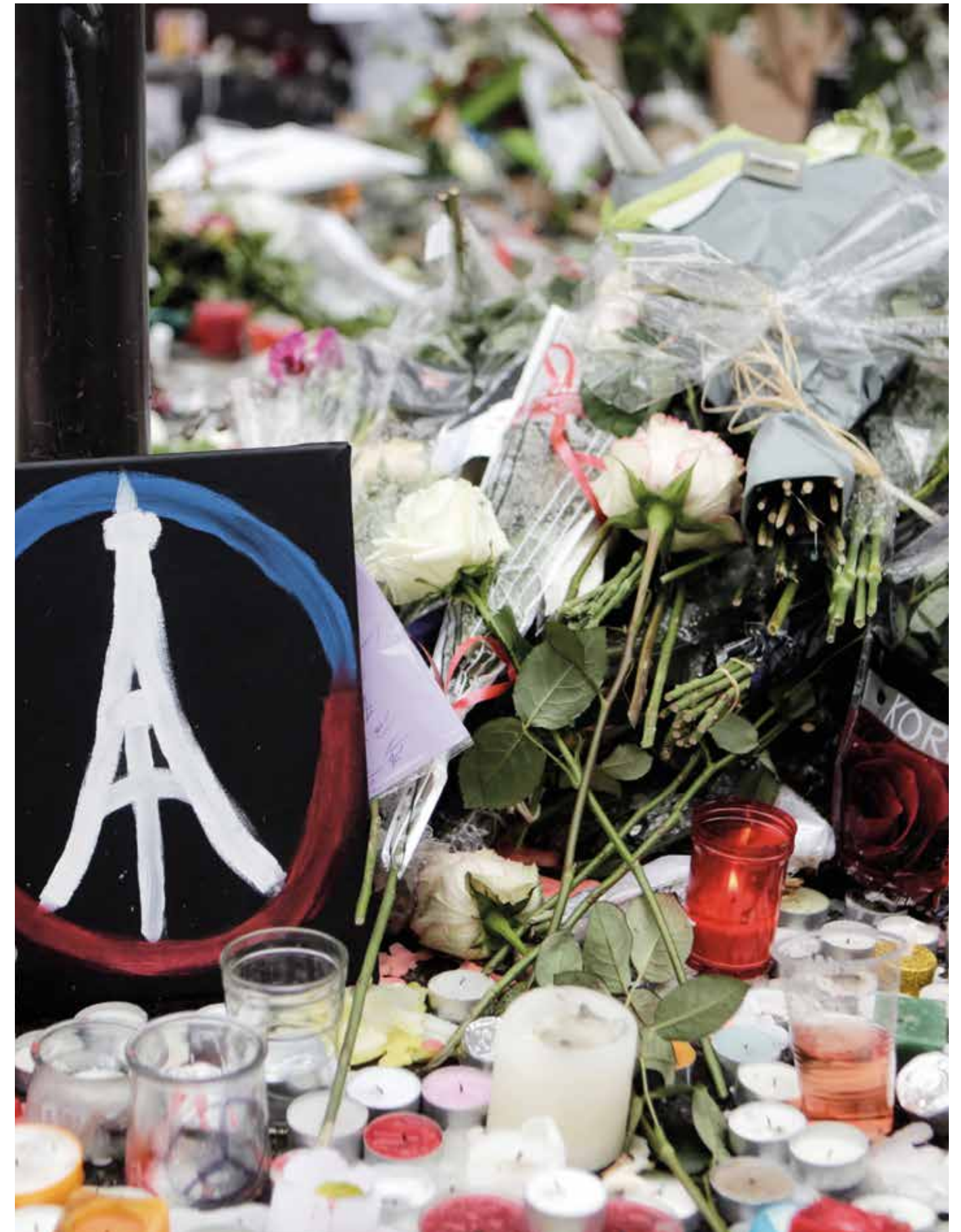
United against terrorism – transnational terrorism poses an immediate threat to our free and open society.

Effectively combating transnational terrorism will therefore require close national and international as well as European and transatlantic cooperation. It will also be necessary to use political, legal, intelligence, police and military resources. Besides hazard prevention, a wide range of additional measures will be necessary in order to successfully deal with the ideological, religious, social and socio-economic causes of radicalisation and terrorism. Radical thinking and behaviour must also be countered at home.