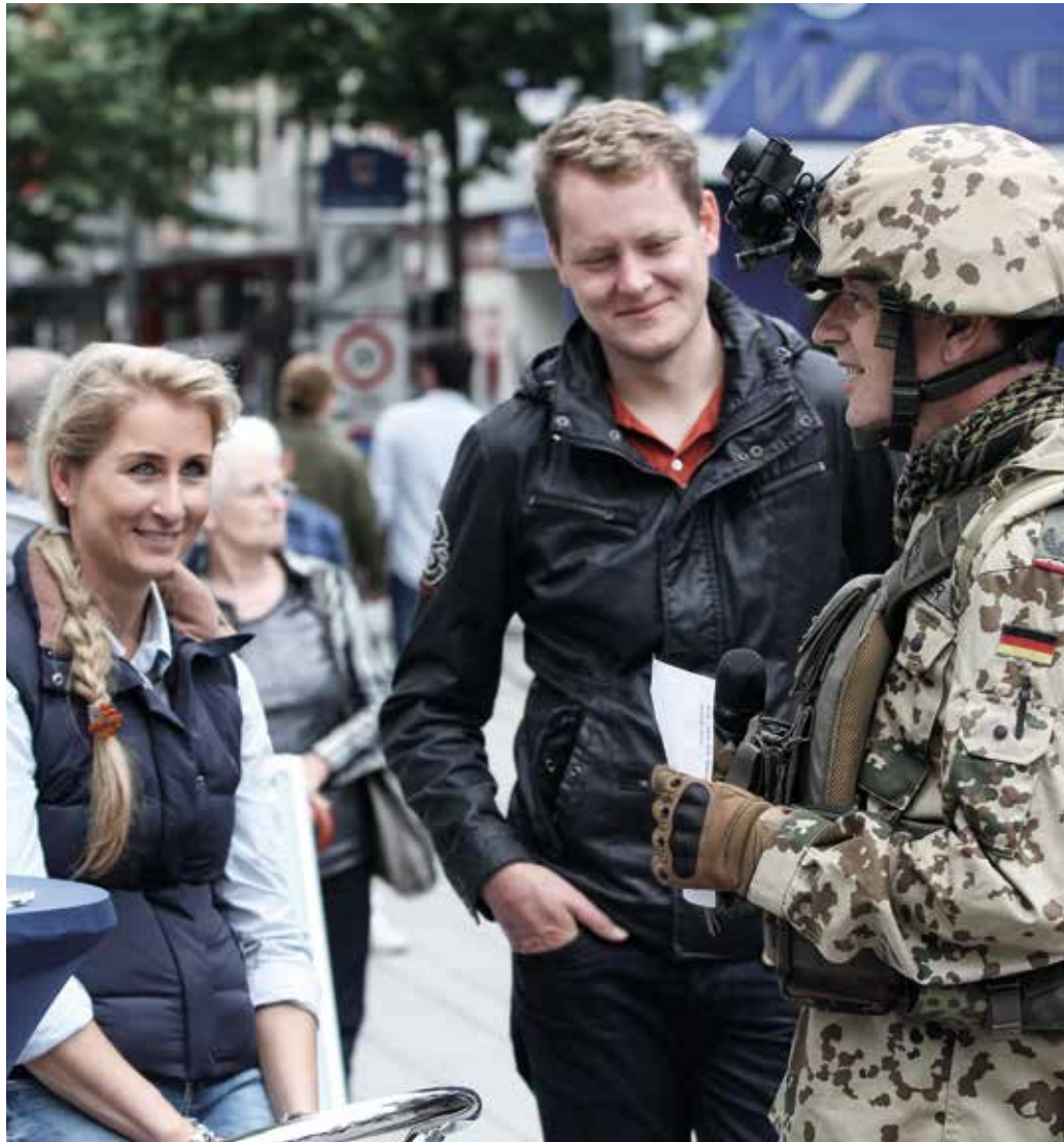
Experiencing and interacting – Bundeswehr Day.