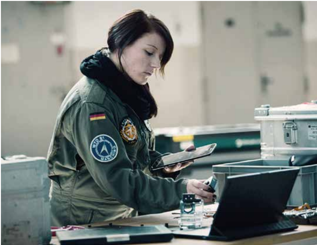
Armaments management today – a service provider for the Bundeswehr.

In addition to equipment, the Bundeswehr will in future be even more reliant on versatile and highly qualified (and thus specialised) personnel. The Attractiveness Agenda has laid important foundations for this purpose. Over the long term it will be necessary to tap additional potential, since technological progress and increasing digitalisation will require expertise that the Bundeswehr itself does not have. Extensive autonomy will no longer be the guiding principle in personnel policy. We must therefore increase permeability between the Bundeswehr and industry and also explore new avenues of cooperation. Transparency and compliance will be guiding principles.