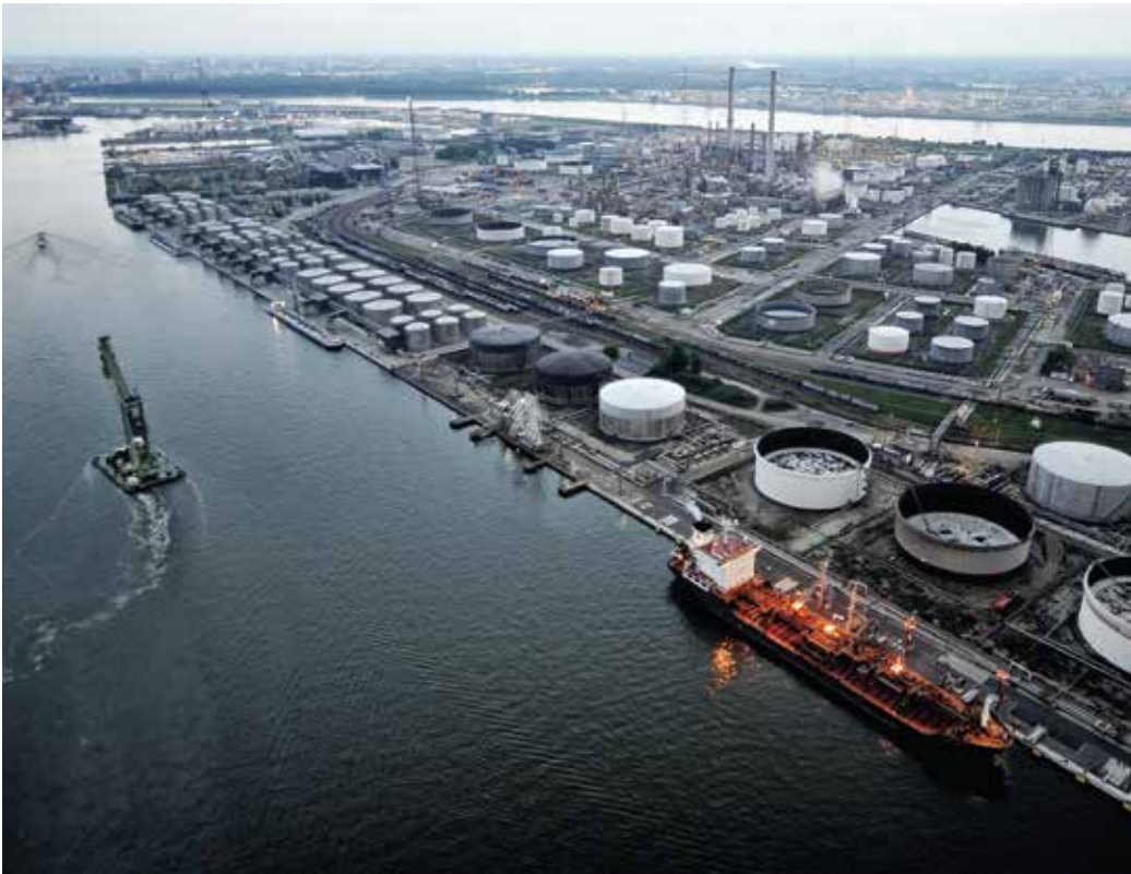
Gateways to global trade – unhindered maritime transport is of great importance for an exporting nation like Germany.

In view of the many potential causes and targets, Germany and its allies and partners must make flexible use of foreign and security policy instruments in order to prevent and remove disruptions and blockades.