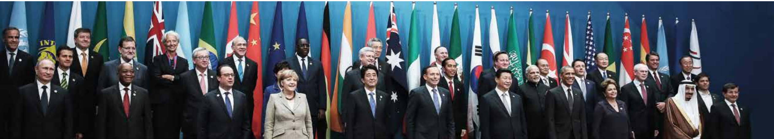
Dialogue and discourse – only together can we tackle the challenges facing us.

Ad hoc cooperation will continue to gain significance as an instrument of international crisis and conflict management. Germany will take account of this development and, in cases where it can protect its interests in this way, will participate in ad hoc cooperation and initiate it with its partners.