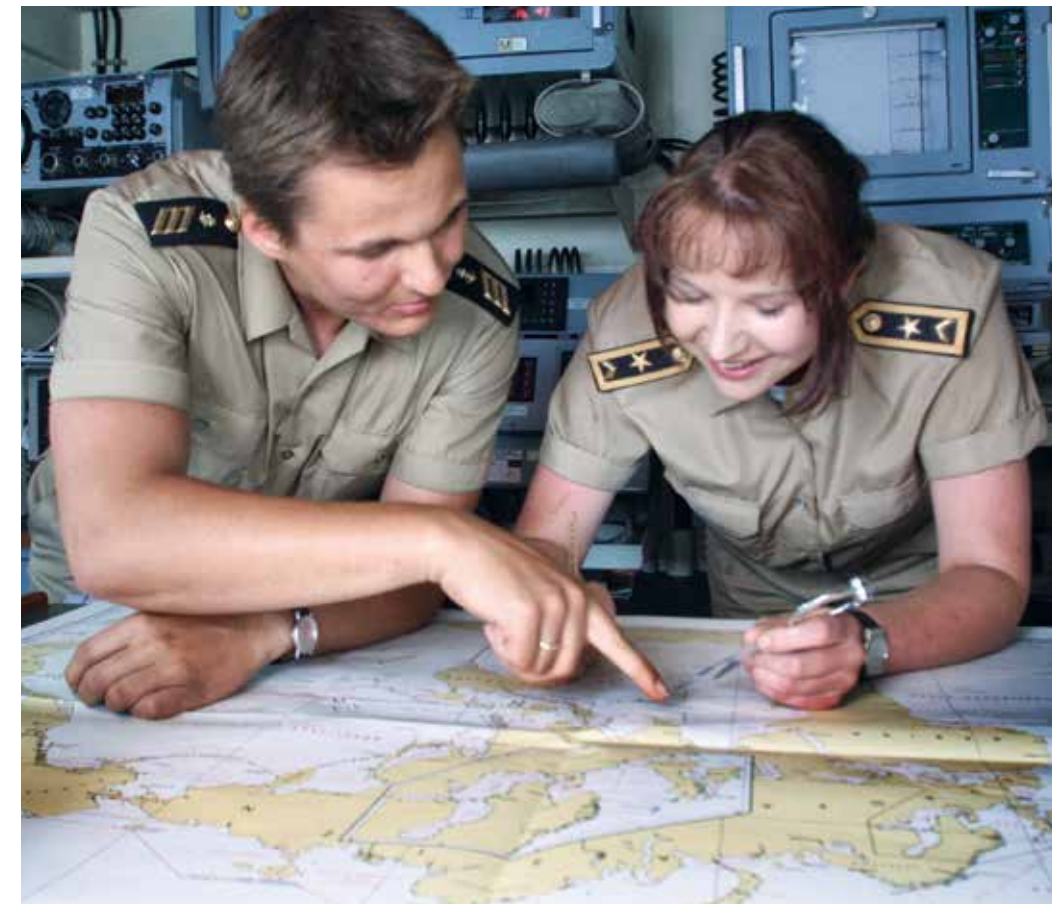
Innere Führung – reaching decisions through dialogue.

The Bundeswehr will continue to be open, modern and widely interconnected in future owing to the strong cohesion and confidence of the people serving in it. The basis for this is Innere Führung, or leadership development and civic education. It is and will remain an indispensable foundation for individual and collective action in the armed forces, as it recognises the conscience of each and every individual as a moral authority. A conflict will remain between personal democratic liberties, on the one hand, and the soldierly principles of duty and obedience, on the other. Innere Führung enables servicemen and women to act with confidence, conviction and skill and make sound judgements. It gives them the courage and assurance to arrive at responsible and ethically informed decisions. This philosophy serves as a guiding principle for human interaction, one that superiors must practice on a daily basis.