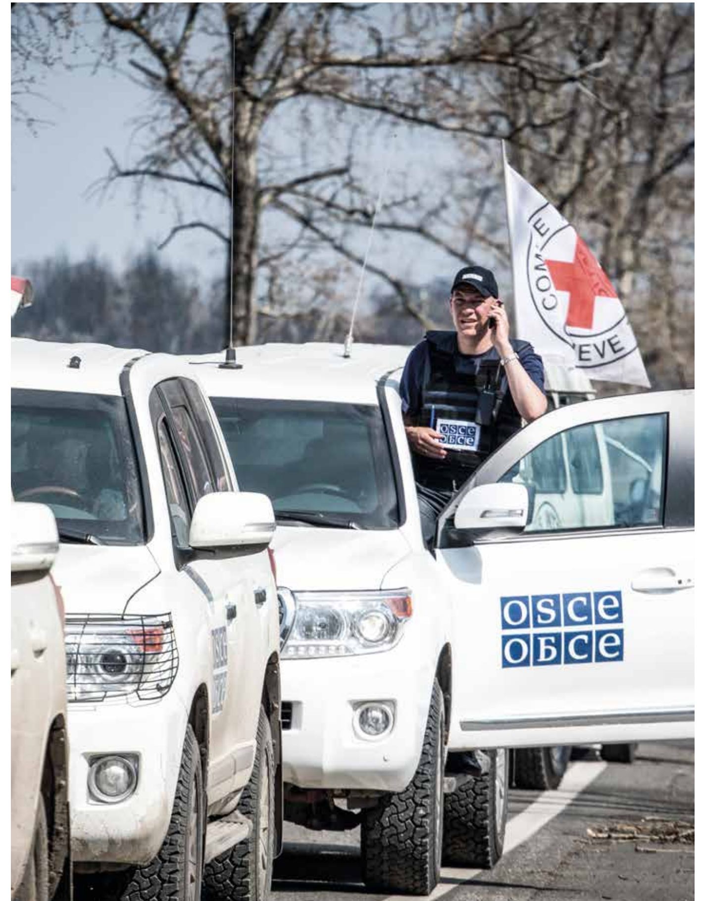
Focusing on transparency and trust – Germany's continued commitment to strengthening the OSCE.