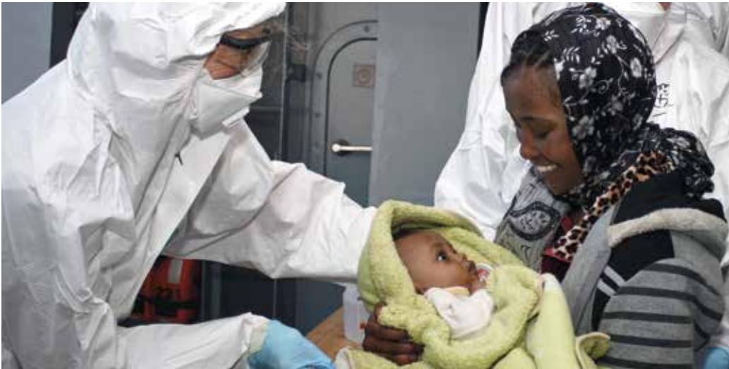
The Common Security and Defence Policy – a wide range of civil and military capabilities.

The asylum, refugee and migration policy and practice of the EU are relevant to, and have an effect on, security policy. The effective protection of Europe's external borders is of central importance. With regard to refugee and migration policy, it is important to ensure equitable burden-sharing at European level and at the same time to develop viable solutions through dialogue with the countries of origin, the initial host countries, and the transit countries.