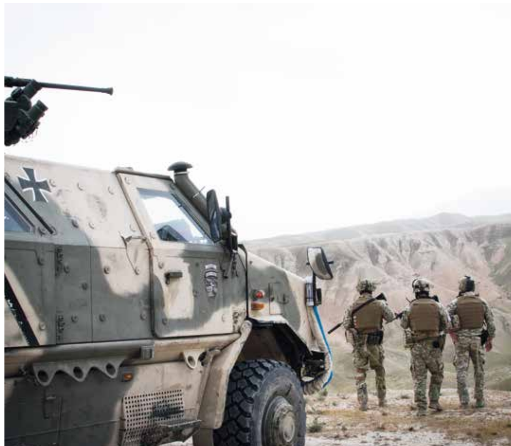
Operations abroad – not only their number but also the demands they make on the Bundeswehr have increased.

The character of conventional national and collective defence has changed in comparison to the Cold War era. Armed forces of today must often face a spatially focused threat posed by military forces below or above the threshold of open warfare at short notice. This is increasingly part of a hybrid strategy that is characterised by the orchestrated use of military and non-military means across the full range of the threat spectrum.