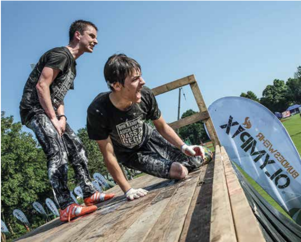
Strong arguments as an employer – early opportunities for a wide range of careers.

Today’s Bundeswehr offers a broad range of career opportunities. Although it can still recruit sufficient personnel five years after the suspension of compulsory military service, the Bundeswehr must tap further potential in the labour market. Similar to industry, the Bundeswehr lacks specialists such as IT experts, engineers and medical personnel. Such people must be directly addressed. We must also increase the percentage of female personnel and personnel with a minority ethnic background. They play an important role in the image the Bundeswehr conveys.