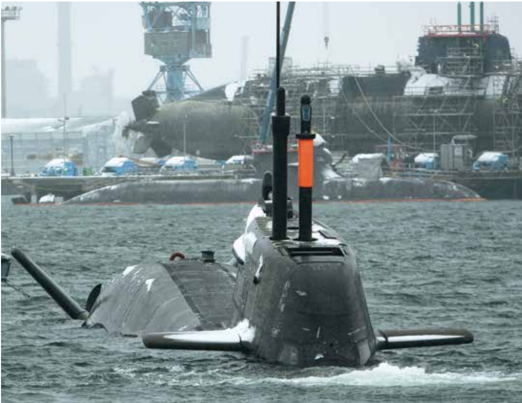
National key technologies – the basis of technological sovereignty.

At the same time we must protect our own technological sovereignty by maintaining key national technologies in order to ensure military capabilities and the security of supply chains. To this end, the Federal Ministry of Defence will make available its special expertise in development, procurement, training and in-service support. To maintain and foster this expertise, the German Government has the following instruments at its disposal: interministerial coordination and prioritisation of research and technology measures; a targeted industrial policy; the awarding of contracts by the Federal Ministry of Defence; and export promotion (performed on a case-by-case basis and in accordance with the German Government’s restrictive guidelines on arms exports from the year 2000). Export promotion is particularly for EU and NATO countries and for countries with a NATO-equivalent status. This support can also be extended to third states if, in the case of war weapons, special foreign or security policy interests call for such measures in individual cases or if, in the case of other military equipment, a threat is not posed to the peaceful coexistence of nations or the foreign relations of Germany, both of which are protected under foreign trade legislation.