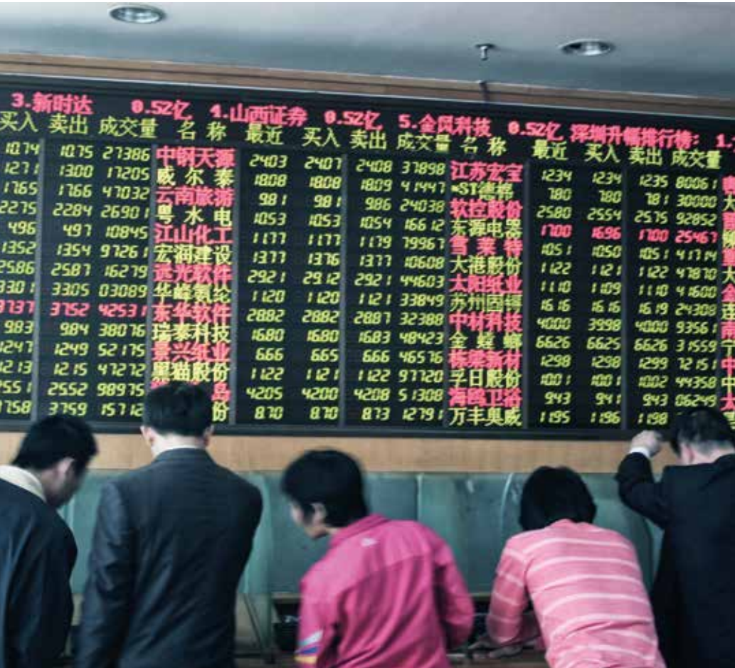
Dynamic growth – power is shifting rapidly between places and actors.

It is estimated that China, for example, could account for one fifth of the global economic output by 2030, while India will account for approximately one sixth. It is likely that these two countries together will have an economy equal in size to that of the entire OECD area by the middle of the current century. When it comes to defence, China already spends approximately as much as all EU states combined. The international influence of other key states will also continue to increase.