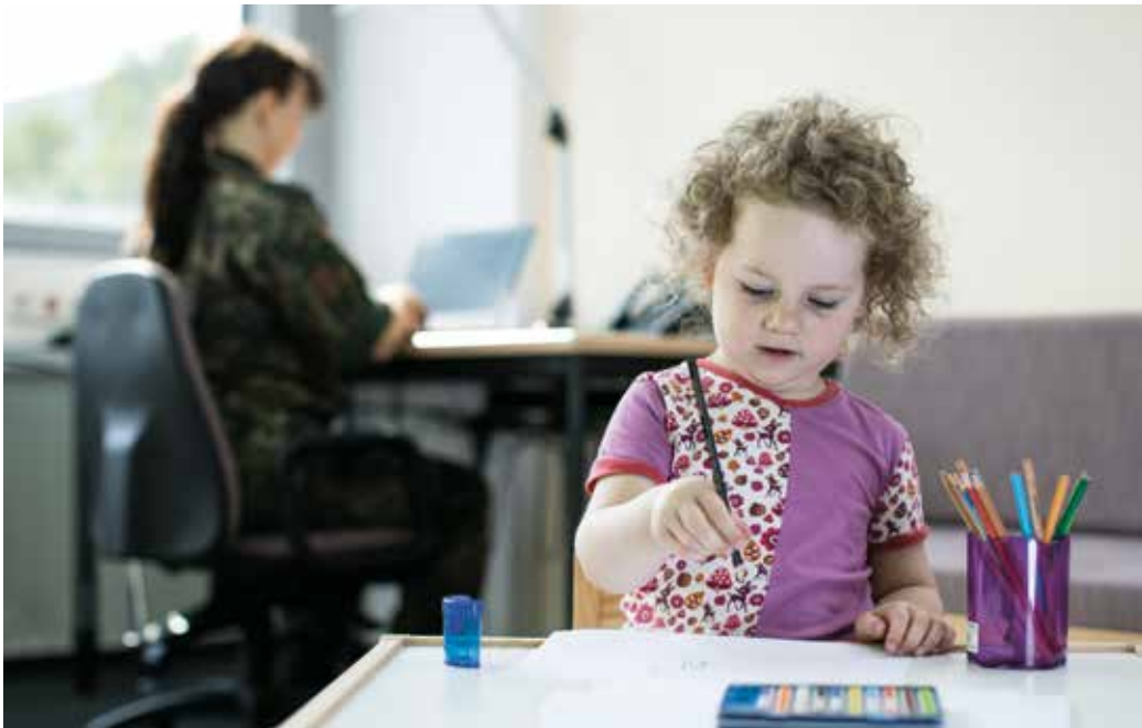
Striking a balance – work and family.

To take better account of the needs of individual personnel, the Bundeswehr is also modernising many of the instruments used in personnel management. The work-life balance plays a central role. Our goal is to ensure that men and women serving in the Bundeswehr will be able to develop their abilities and talents to the fullest in all life phases. All of the steps we have taken and will take in the future are intended to foster an integrated body of military and civilian personnel and a Bundeswehr-wide identity. Further efforts to boost the attractiveness of serving in the Bundeswehr will be required. Improving the attractiveness and sustaining the competitiveness of the Bundeswehr as an employer remain an ongoing strategic task. The attractiveness of the Bundeswehr will always be influenced by the attitude and satisfaction of its personnel.