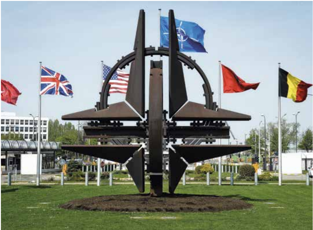
NATO – an indispensable guarantor of German, European and transatlantic security.

Effective collective defence is vital to our existence in view of the return of violence and violent threats to European politics and the instabilities in NATO’s neighbourhood. This is particularly true in light of the worldwide proliferation of weapons of mass destruction and their means of delivery, not to mention the extensive military build-up taking place in many states. NATO will continue to rely primarily on deterrence to counter external threats. For this purpose, the Alliance maintains and develops a coordinated strategic spectrum of nuclear and conventional capabilities, including missile defence.