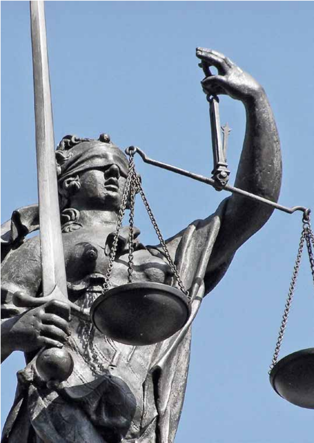
Right not might – Germany is committed to the global enforcement of international law.

The full effect of rules and norms can only unfold, however, if effective sanctions are imposed in case of violations of these rules and norms. In this context, the range of instruments for imposing economic and personal sanctions must be refined and made more targeted. In addition, Germany advocates strengthening international criminal prosecution and jurisdiction.