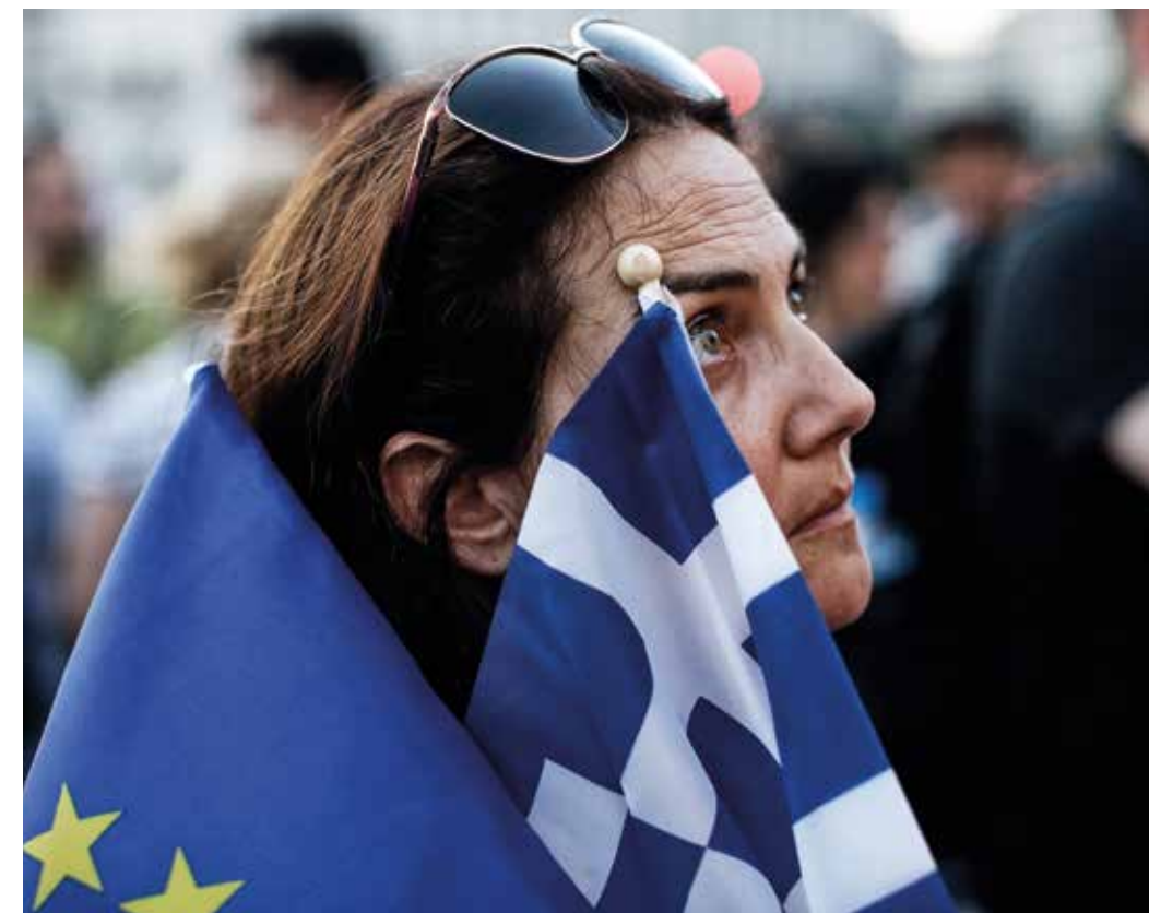
Resolute and united – even in times of crisis.

The EU will have to make a substantial effort to stay in the lead economically and technologically and to remain a role model for other societies around the world. It will continue to have a stabilising effect on its neighbours only if it overcomes internal fault lines, successfully counteracts centrifugal forces, resolutely continues on the path of modernisation and innovation, and thereby strengthens its internal cohesion and unity. It is therefore necessary to take full advantage of the opportunities provided by the Treaty of Lisbon.