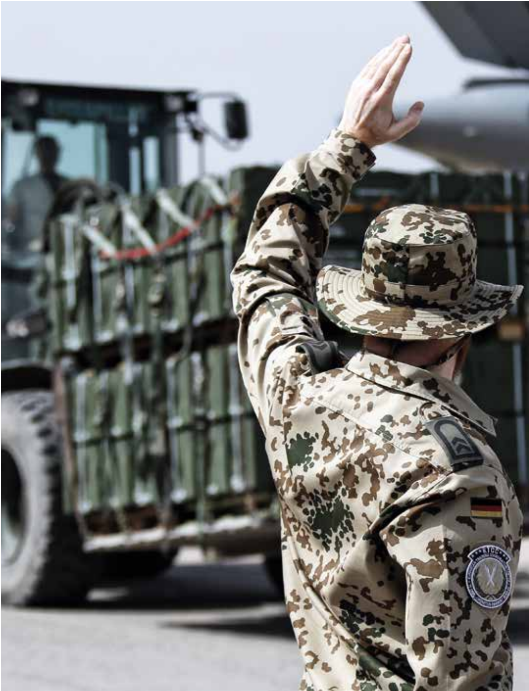
Support – indispensable for mission accomplishment.

Support is an elementary prerequisite for command and control, reconnaissance and effects. It must – including with recourse to contributions from industry – enable all military and civilian organisational elements to accomplish their tasks. Logistics, healthcare, and routine duties at home are necessary prerequisites for accomplishing our mission. In the changed task spectrum of the Bundeswehr, we must in particular lay the foundations for ensuring our ability to project force, to deploy, and to act alongside partners. We must further develop support at the national level and coordinate it with other nations, with an eye towards Germany’s role as a framework, lead and host nation.