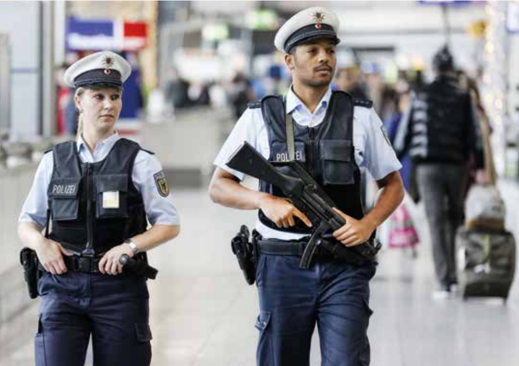
The whole-of-government approach to security has many faces – our approach to ensuring security begins in Germany.

Our commitment to international security and stability is at the same time a contribution to our national security. Both require a strategic capacity and forward thinking as well as sustainable resources and the networking of our security instruments.