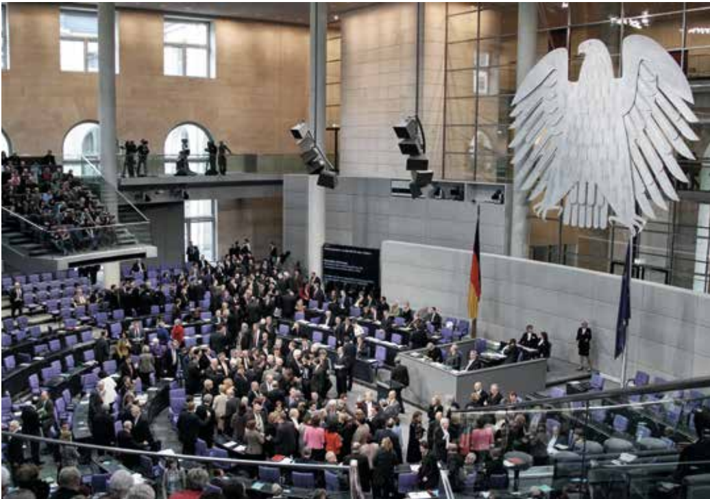
The Government in concert with parliament – our servicemen and women on deployment can rely on a broad base of consent.

For Germany as a NATO member as well as for any further integration in the EU, we must be able to act and to play a substantial role in a reliable manner in these institutions.