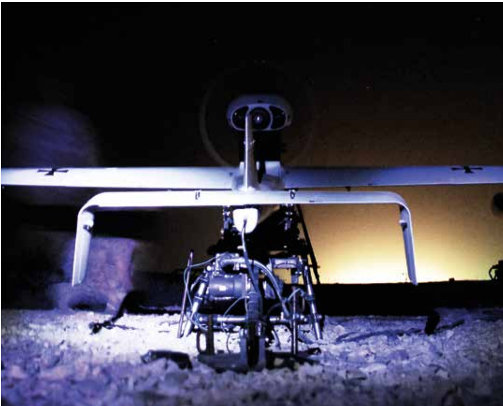
A clear operational picture – essential for our analysis and military decisions.

Globally oriented and multinationally compatible reconnaissance is essential for effective intelligence collection and thus for the ability to analyse, assess and lead at the strategic, operational and tactical levels. The German Government thus requires continual contributions to maintain situational awareness at the interministerial level and to develop its options. Reconnaissance must encompass the entire spectrum of national and international crisis prevention and of crisis management. The early recognition of crises plays an important role in this context. The build-up of regional expertise must therefore be encouraged and sustained.