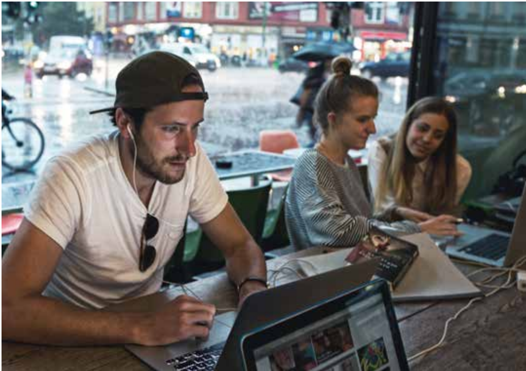
Unlimited, interconnected and interactive but not without risks – digitalisation comes with new opportunities as well as dangers.

At the same time, globalisation is also promoting the interconnection and spread of risks as well as their repercussions. These include epidemics, the possibility of cyber attacks and information operations, and transnational terrorism.