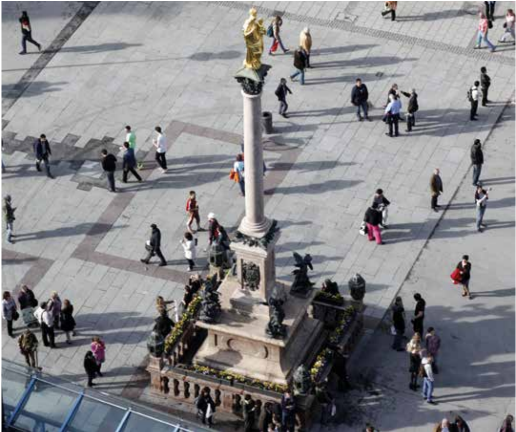
Freedom, prosperity and security – the goal and ambition of German security policy.