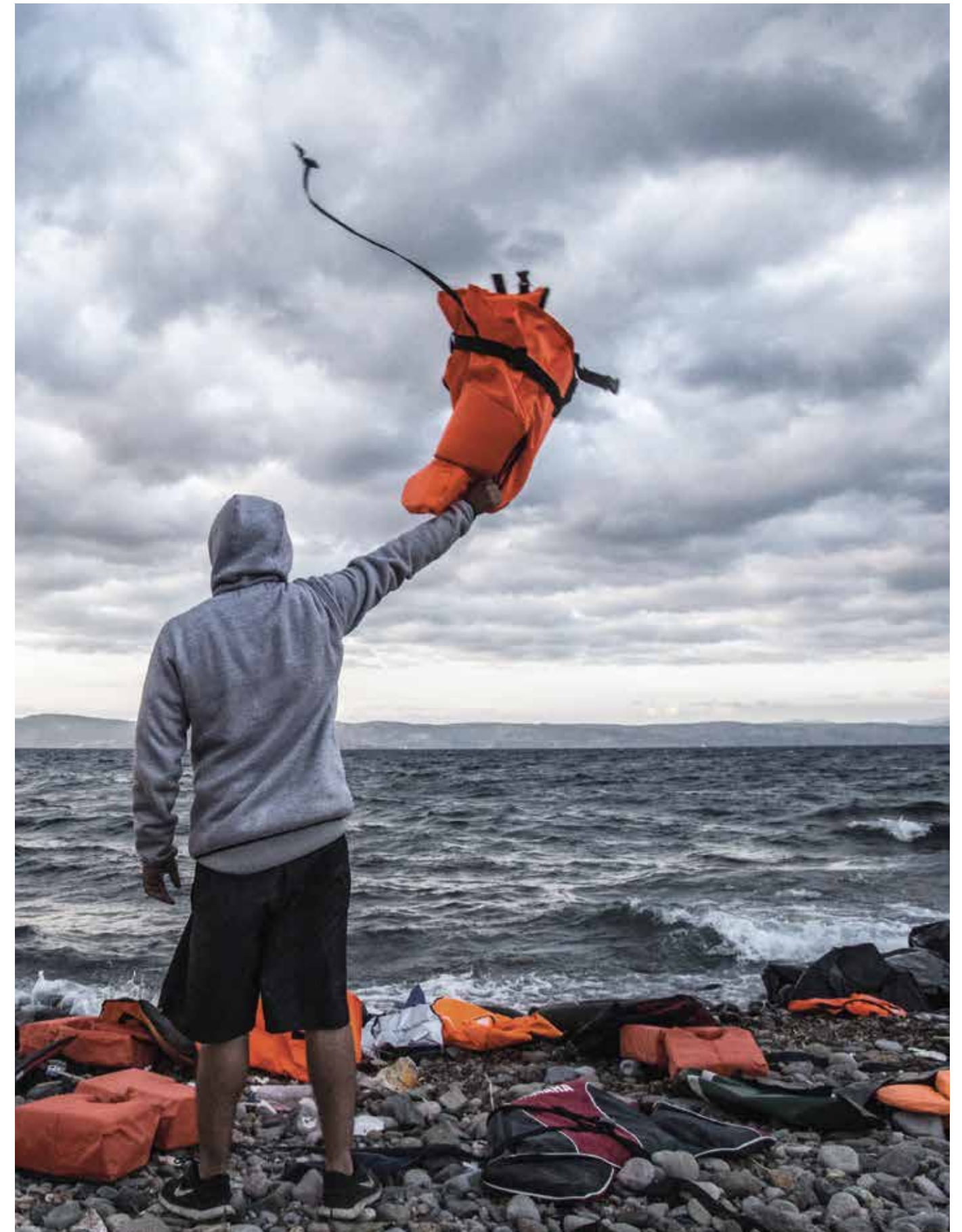
Irregular migration – a challenge for Europe as a whole.

Germany embraces its responsibility for managing the humanitarian consequences of refugee movements. This challenge can, however, only be appropriately controlled and managed on the basis of an effective European strategy and practice.