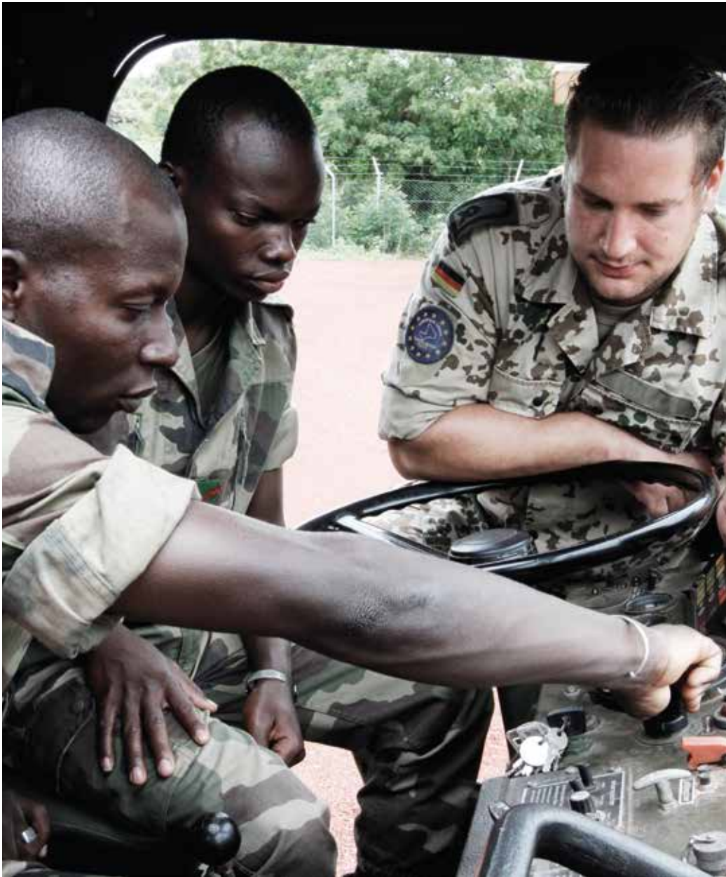
Enhancing and enabling partners – today’s task spectrum is changing our understanding of effects.

Particularly in the case of military force, precision and scalability are important prerequisites for delivering intended effects and avoiding collateral damage. Standoff capability increases the likelihood of success and improves the survivability and sustainability of our forces.