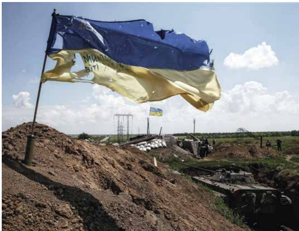
Communities torn apart – the EU is facing a number of challenges.

What is important for the common security space of our continent is thus not the development of a new security architecture, but rather respect for and consistent adherence to existing and proven common rules and principles.