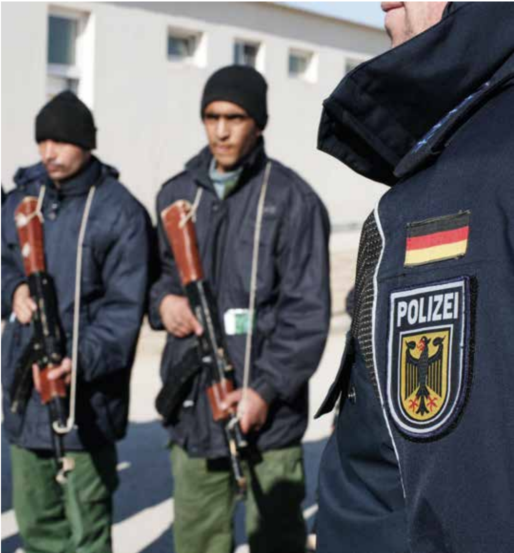
Building state structures – empowering regional actors to assume responsibility for themselves is an expression of our preventive approach.