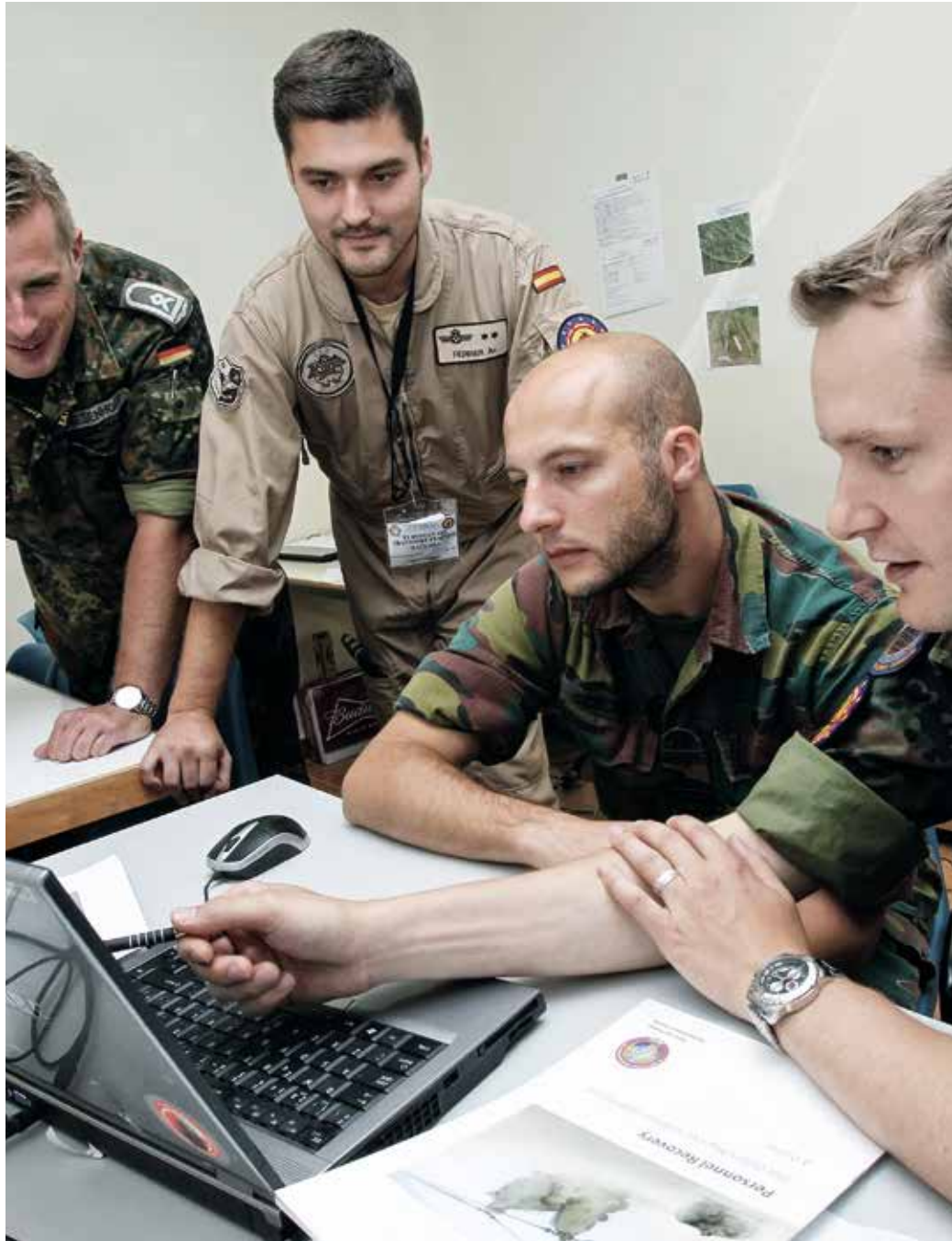
Joint exercises for joint action – multinationality is today common practice in all European armed forces.