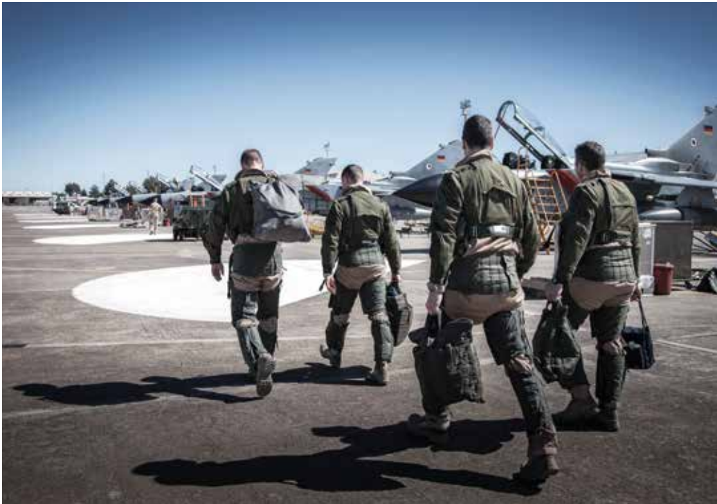
Immediate and resolute – operations abroad contribute directly to our security.

In recent times the number of deployments and missions necessitating immediate and resolute action has grown. A rapid response is frequently called for when it comes to countering the proliferation of weapons of mass destruction, tackling human and drug trafficking on the high seas, and supporting partners at short notice in stabilisation operations. This increasingly leads to ad hoc cooperation between states.