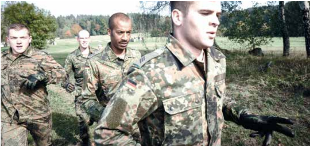
Diversity and equal opportunities – encouraging and harnessing potential.

The aim is to establish a modern diversity management approach in the Bundeswehr which makes better use of available potential and strategically develops future potential. This will focus on areas such as age, inclusion, ethnic or cultural origin, gender, religion, and sexual orientation. Diversity management is a top priority at all command levels. This underscores the comprehensive and strategic character of this task for the Bundeswehr as a whole.