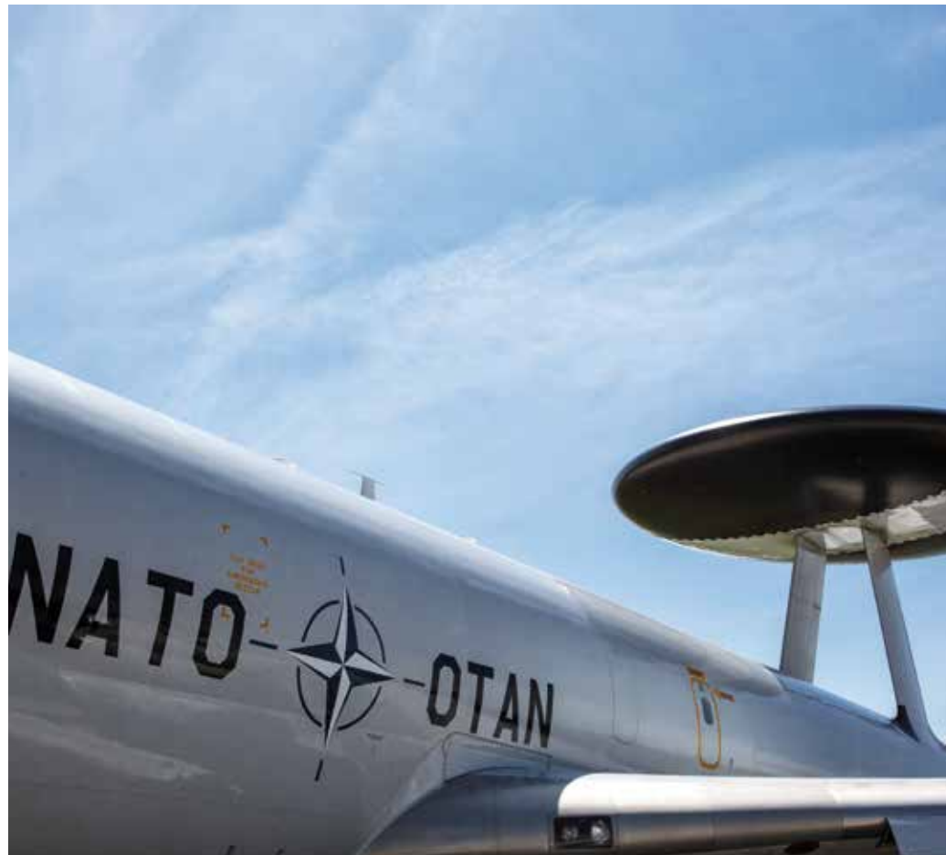
A defence alliance and community of values – international cooperation on a daily basis.

A further important element of cooperative security is NATO's active contribution to arms control, disarmament and non-proliferation.