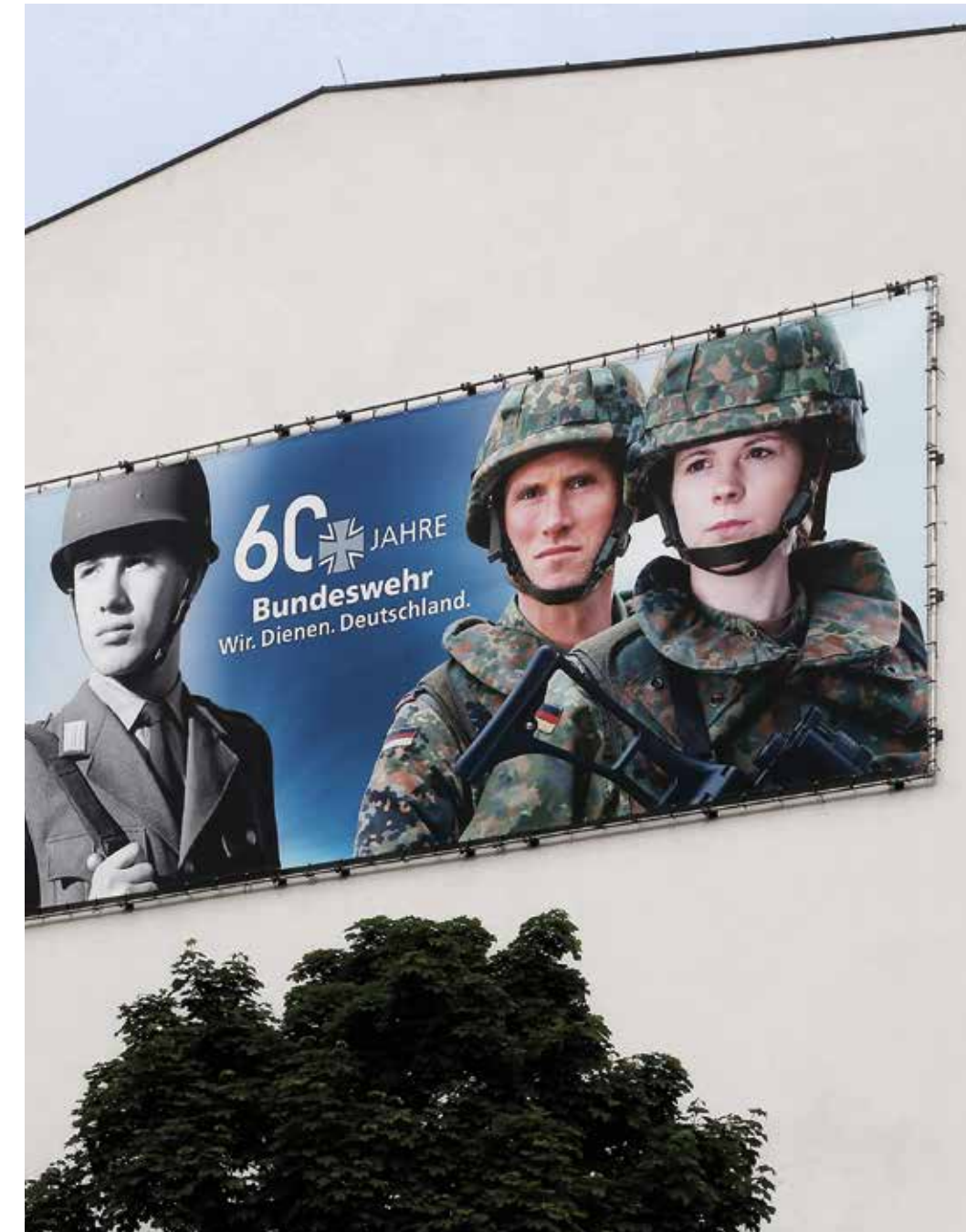
More than 60 years of history – a strong anchor for tradition in the Bundeswehr.

For this purpose, the Bundeswehr will be placing increased emphasis on its own successful, over sixty-year history as a tradition to be cultivated. It is a history of armed forces in a strong democracy which proved themselves not only in the Cold War but also after 1990, when they embodied the reunification of our country from the first day onward. It is also the history of a force on operations. Servicemen and women have shown what they can do in combat and have proven their readiness and skills. The Bundeswehr has had to learn to deal with death and combat injuries. This has prompted the creation of places of remembrance such as the Bundeswehr Memorial in Berlin and the Forest of Remembrance in Potsdam.