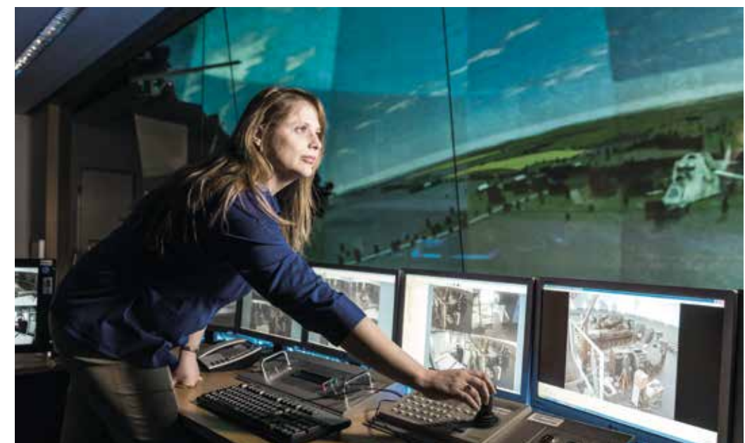
The Bundeswehr – innovative approaches and processes of a learning system.