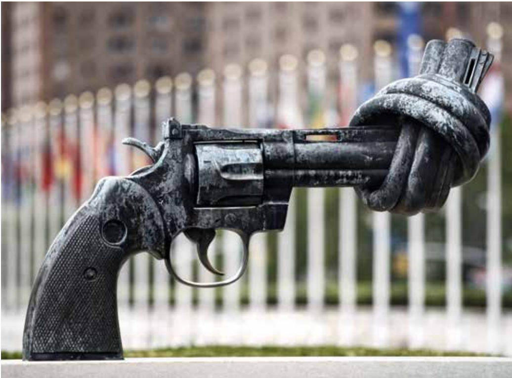
The UN – responsible for world peace.