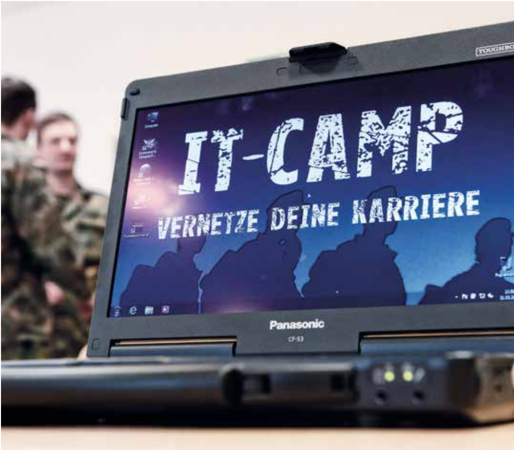
Modern requirements – technological progress and digitalisation call for highly qualified personnel.

In future, the Bundeswehr will rely even more on multi-talented, specialised and highly qualified personnel. In the long term, we must tap additional potential because technological progress and digitalisation will require expertise that the Bundeswehr does not have, at least to the necessary extent. Extensive autonomy will no longer be the guiding principle in personnel policy. Instead, permeability between the Bundeswehr and industry will have to be increased. Exchange schemes between industry and the Bundeswehr which facilitate cooperation with external personnel for a specific period of time are one way of meeting this challenge.