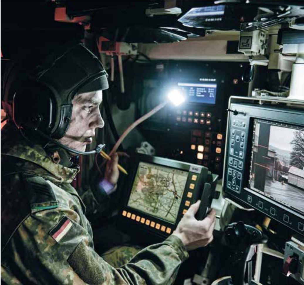
Mutually benefiting from an exchange of knowledge and experience – the role of reservists is changing.