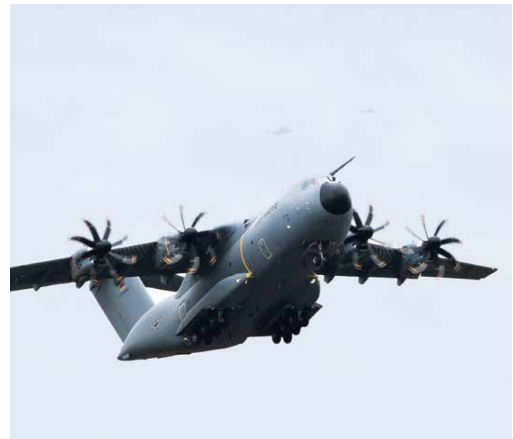
Capability development in NATO and the EU – a framework for the orientation of the Bundeswehr.

The Framework Nations Concept initiated by Germany meets these requirements.