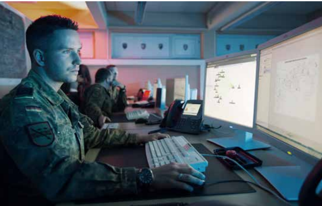
Effective information and knowledge management – the starting point for modern command and control.

To this end, the Bundeswehr structures its capabilities according to the areas of command and control, reconnaissance, effects and support. These areas are equal and mutually dependent and must therefore be interlinked. An agile, resilient and robust Bundeswehr must be ensured in this engagement network.