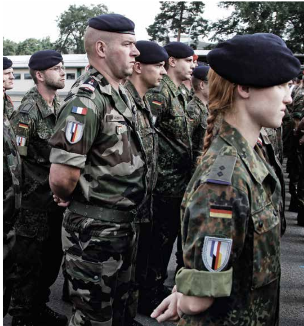
Multinationality – a daily reality in the Bundeswehr.

Multinationality and integration are and will remain key elements of the Bundeswehr. In order to shape defence and military policy, we must ensure that the Bundeswehr has a comprehensive set of bilateral and multilateral instruments that are consistently used and continually updated. Multinationality and integration are realised in particular in structures, operations, long-term joint multinational capability development programmes, and other forms of cooperation as well as in armaments policy.