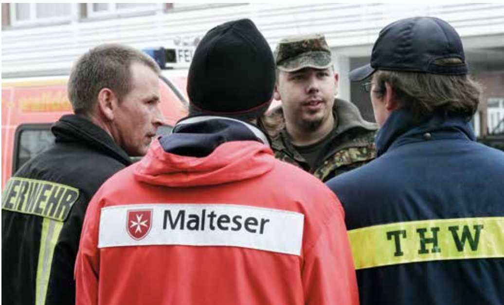
Whole-of-government effort – the Bundeswehr is part of the comprehensive approach.