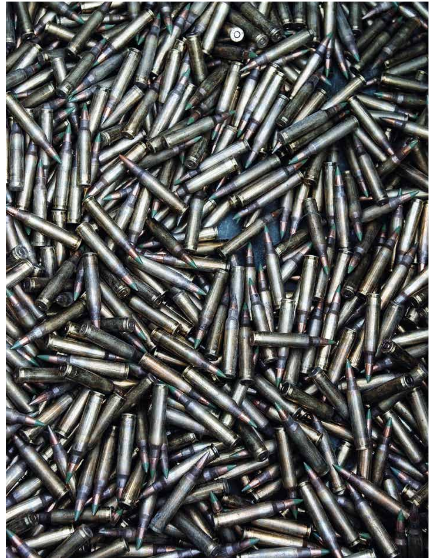
Arms control and responsible disarmament – elements of a forward-looking and sustainable security policy.