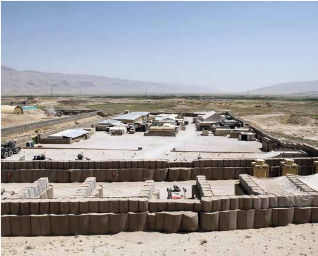
Flexible and adaptable – demands made on our organisation, not just on operations.

The type, scope and intensity of the tasks performed by the Bundeswehr have changed and will continue to change, however, due to the dynamic and complex security environment. For this reason, we must continually coordinate tasks, available personnel and material resources as well as structures.