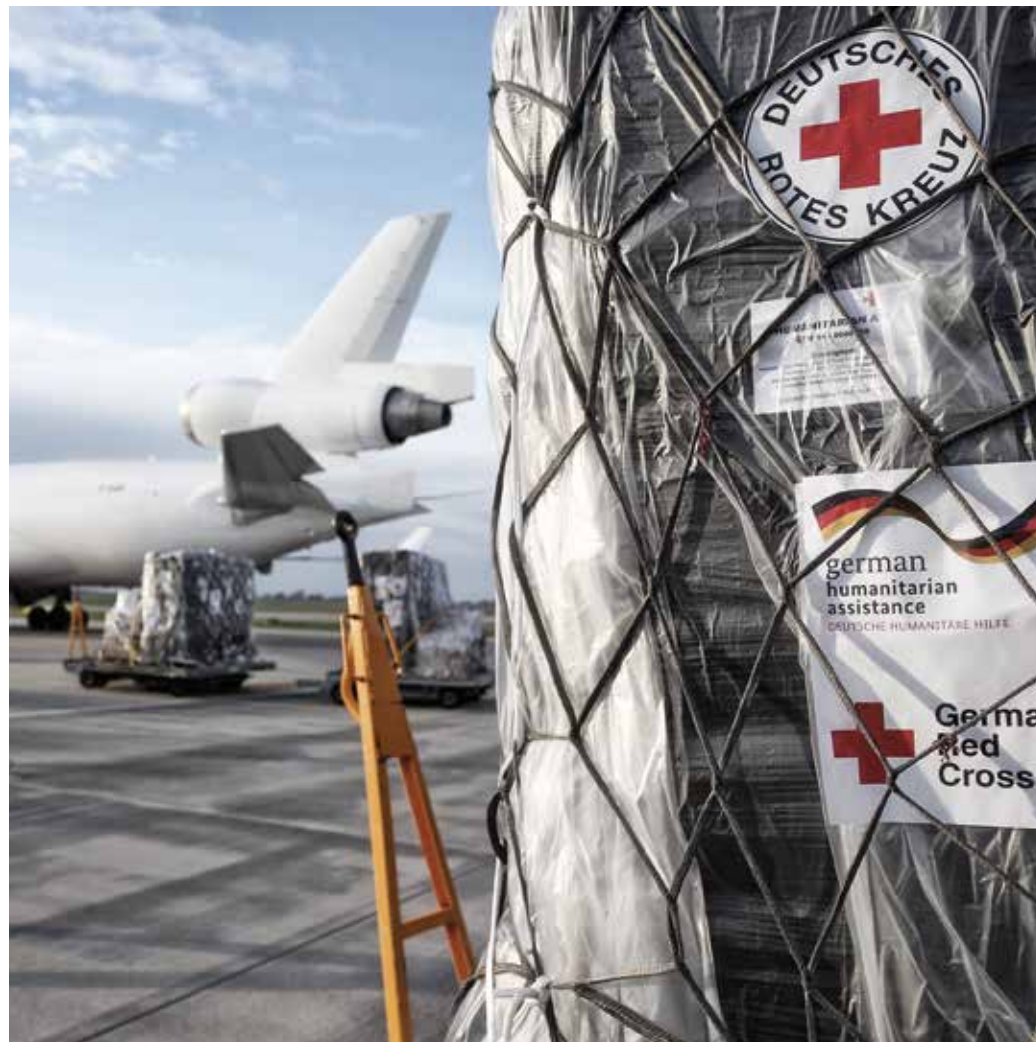
Together even stronger – state and non-state actors have long worked together, not only in providing assistance in areas of crisis and conflict.