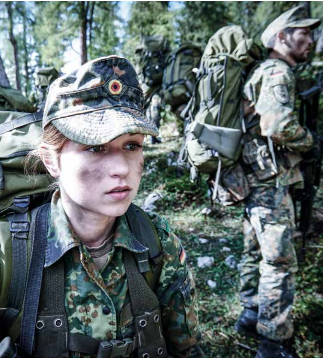
Our personnel – the most important factor for success.

The people serving in the Bundeswehr are the most important factor for the operational readiness and responsiveness of Germany’s armed forces. A major organisation such as the Bundeswehr requires a modern, sustainable and demographically sound personnel policy that will consistently and actively meet future demands. Demographic changes in Germany and the growing shortage of skilled workers will have a marked impact on social and economic developments over the coming decades. The Bundeswehr is affected by associated phenomena such as population aging and the thinning-out of rural infrastructure as well as by increasing globalisation, digitalisation and individualisation. Changes in life goals and realities necessitate a better work-life balance. As an employer, the Bundeswehr must respond flexibly and proactively to all these challenges. The Bundeswehr can ensure mission accomplishment and operational readiness only if it has a body of personnel that is tailored to actual requirements. It must position itself constantly as a competitive, flexible and modern employer. Since the end of the Cold War, personnel numbers in the Bundeswehr have undergone continual and significant reductions. Most recently, the reorientation of the Bundeswehr in 2010/2011 set the personnel ceiling at its lowest level ever.