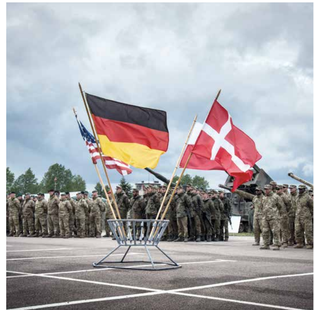
Atlantic partners – united in safeguarding security.

Germany introduced the Framework Nations Concept into NATO. This concept requires European NATO members to pool their capabilities to form multinational capability clusters in a structured and binding approach, and also to arrange themselves into larger units. The German Government is committed to increasing the relevance and visibility of European capabilities within NATO.