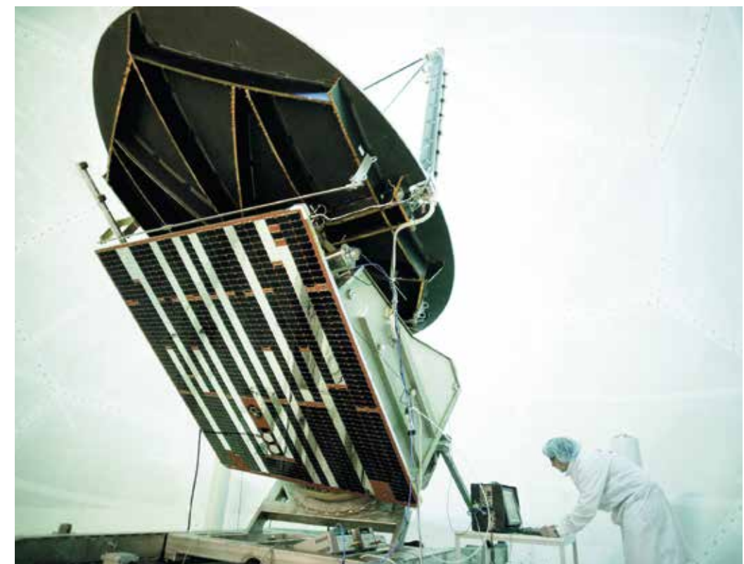
Superiority through innovation – the ambition of our R&T activities.