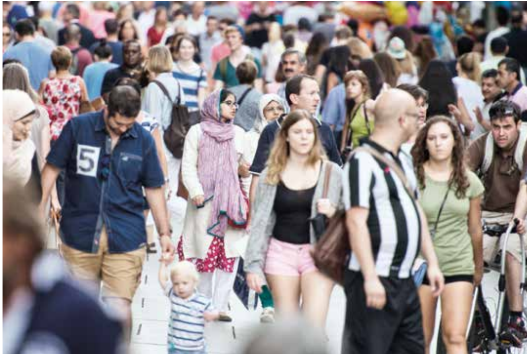
A society in transition – Germany too must meet the challenges of urbanisation and demographic change.

In many parts of the world, the state, as the central element of order, also faces other challenges to its legitimacy and competency: Poor governance and informal economies, which are characterised by widespread nepotism and corruption and are frequently associated with organised crime, are contributing to innerstate conflicts as well as regional and international crises.