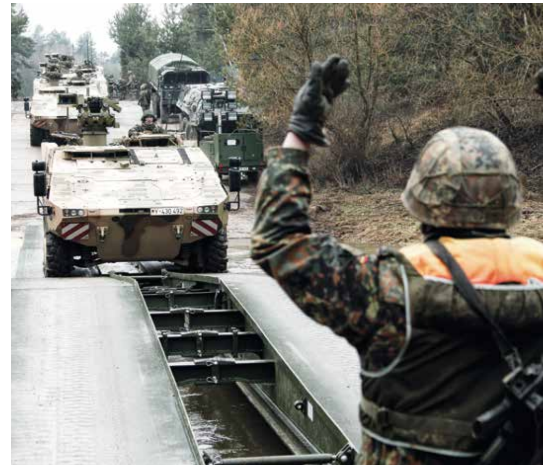
National and collective defence – no less important than operations abroad in the task spectrum of the Bundeswehr.

As a result, we must enable the Bundeswehr to deliver effects across the entire operational spectrum and ensure that it is ready and capable.