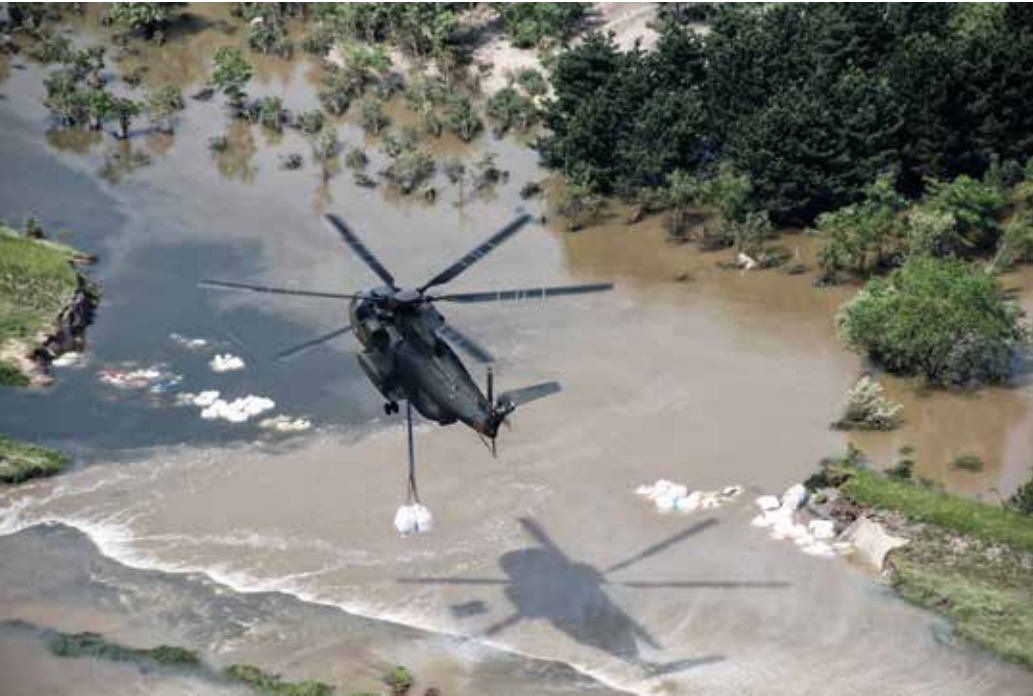
A reliable partner – not only abroad but also at home.

Irrespective of this, the German Government can, in a state of defence or tension, employ the armed forces for facility protection and traffic control responsibilities pursuant to Article 87a(3) of the German constitution. According to Article 87a(4) of the constitution, the armed forces can also be deployed in the event of an internal emergency if the conditions referred to in Article 91(2) are fulfilled, in other words if there is an imminent danger to the existence or free democratic basic order of Germany or of a federal state. The strict conditions to which the use of the armed forces in internal emergencies is tied precludes any recourse to Article 35(2) or (3) of the constitution.