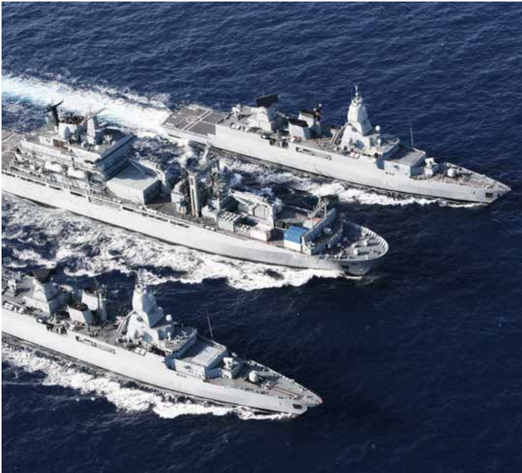
Responsibility in matters of foreign and security policy – the security of our maritime routes is of great importance.

On account of our identity, the role we see for ourselves, and the international role of Germany in a challenging security environment, our strategic priorities must be pursued simultaneously. The following tasks of the Bundeswehr are thus of equal importance. The execution of these tasks may vary, however, in terms of character and intensity.