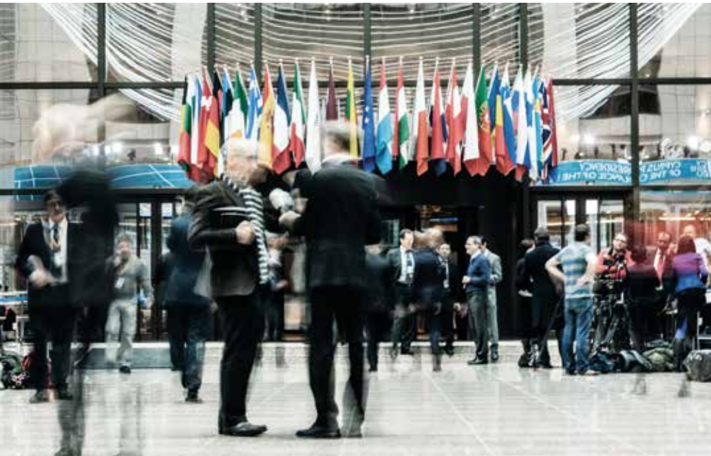
Unity and diversity – features that have defined Europe for centuries.

The prospect of one day being able to join the EU has had a stabilising effect over many decades. It is in Germany's fundamental interest to strengthen this enhanced security and to maintain the momentum of EU enlargement. This will depend not least on whether the European Union can remain attractive. This requires not only strengthening the EU's internal cohesion but also strict adherence to the accession criteria (Copenhagen criteria). The appeal and drawing power of the European peace project is the key to global influence and respect.