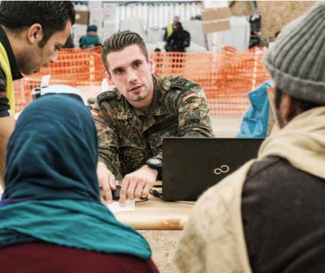
A whole-of-government approach to security – dealing with emergencies, disasters and new threats is a task we all share.

Strengthening the resilience and robustness of our country so that it can deal with current and future threats is of particular importance for our whole-of-government approach to security. This means intensifying cooperation between government bodies, citizens and private operators of critical infrastructure, as well as the media and network operators. Everyone involved in this approach must work closely together.