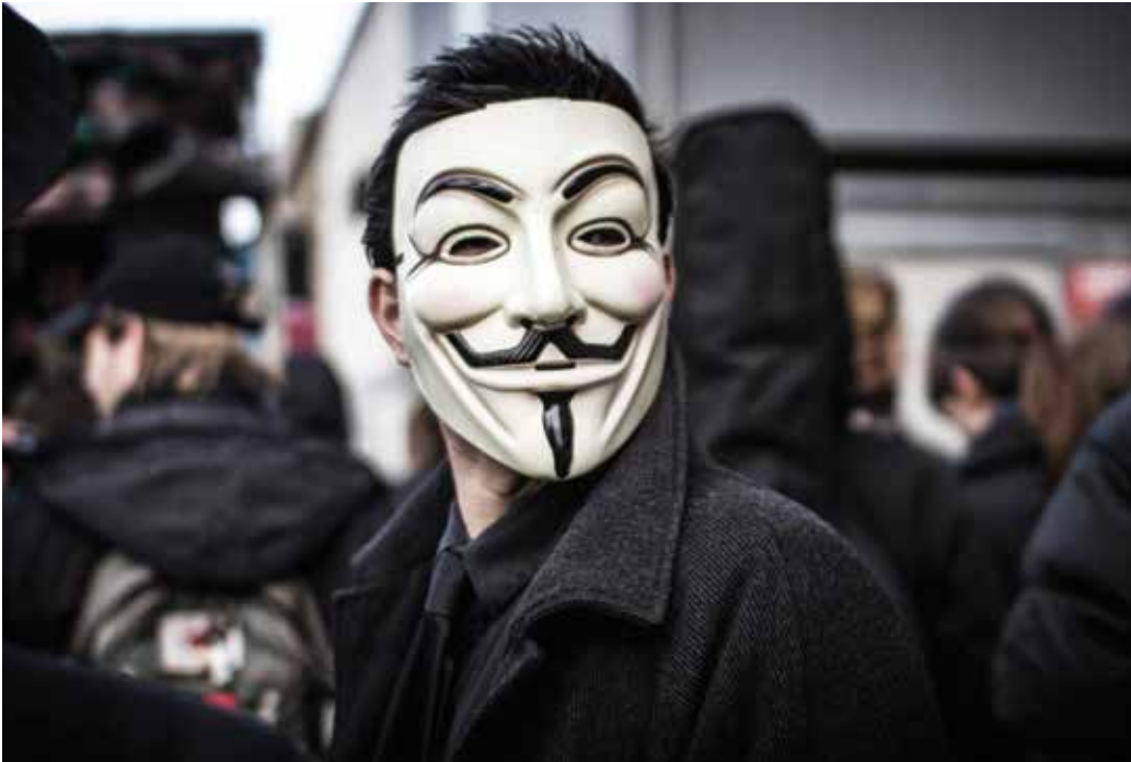
Concealed identities – anonymous actors are finding ever more ways to exert their influence.

On the whole, the cyber and information domain has become an area of international and strategic importance that has practically no limits. Its significance will continue to grow.