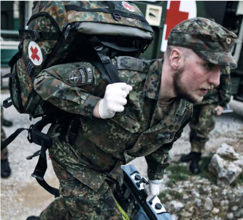
Comprehensive support – an integral part of every operation.